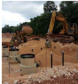
DESIGN-BUILD AND FUELS CONSTRUCTION