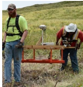
MUNITIONS AND RANGE SERVICES